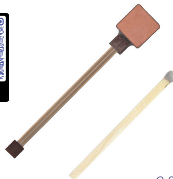
Q-Sens, Gen. 1