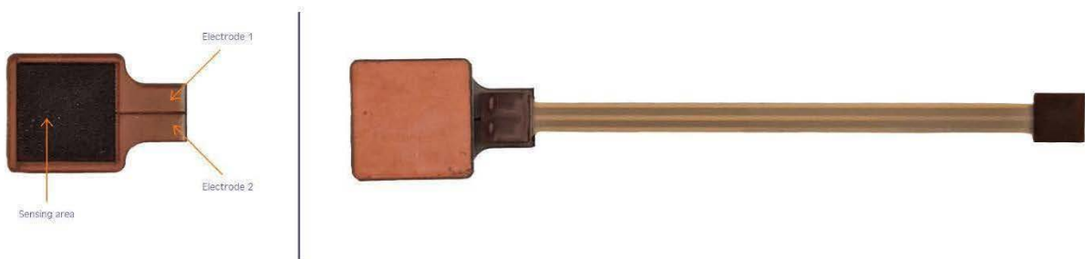
Figure 1: Sensor plate overview and Assembled Meerstetter Heat Flux Sensor

It is designed for seamless integration (Figure 1) into the Meerstetter control universe, with all necessary signal conditioning supplied directly by Meerstetter. Engineered for stability in harsh operating conditions, it is optimized for long-term monitoring in extreme thermal environments. Its property flexibility allows for the selection of various materials to achieve either low heat resistance and high operating temperatures or enhanced sensitivity, depending on application requirements. Operating passively, it is an ideal solution for remote sensing and embedded systems. Furthermore, its customizable geometry, enabled by a thermoelectric metamaterial composite design, allows for precise sensor tuning to meet specific needs, with the potential for effortless integration into existing industrial setups.