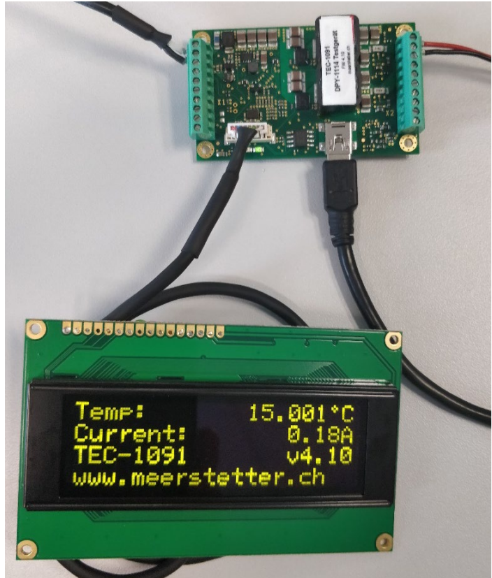
Display connected to TEC controller