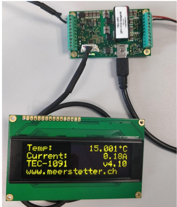
Display connected to TEC controller